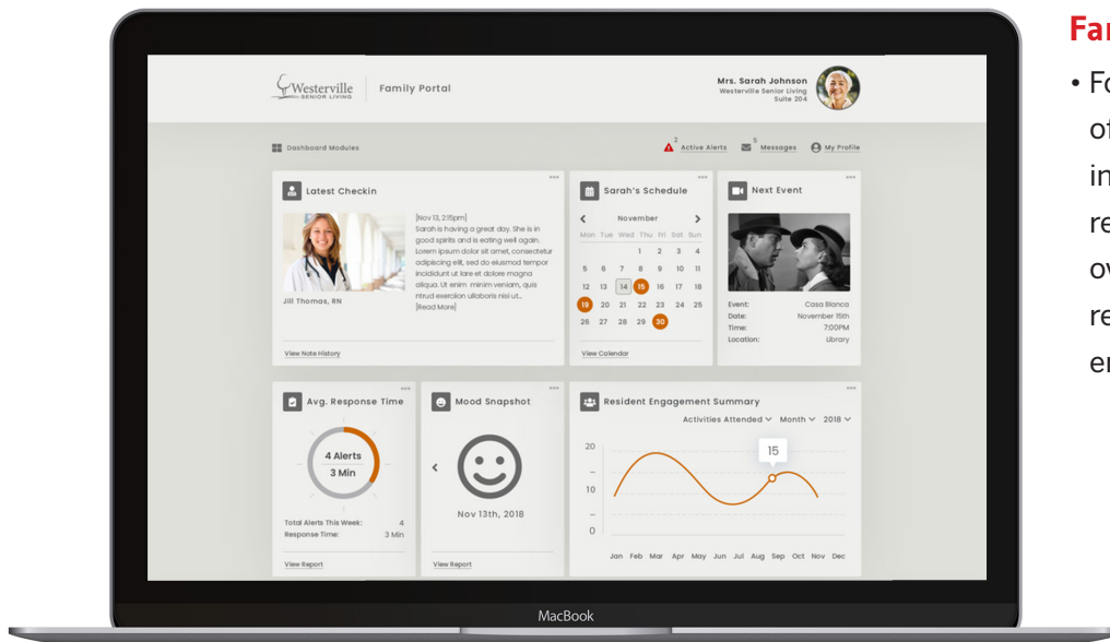
Example of the Family Portal on laptop.