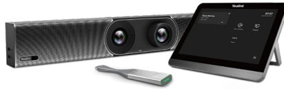
A30+CTP18+WPP20 for Teams