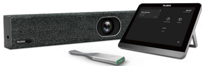
A20+CTP18+WPP20 for Teams