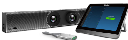
A30+CTP18+WPP20 for Zoom