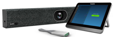
A20+CTP18+WPP20 for Zoom