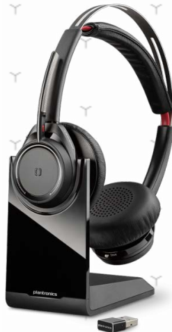
Voyager Focus UC