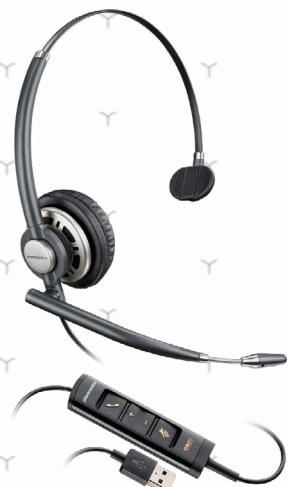
Encore Pro 700