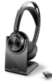
VOYAGER FOCUS 2 UC WITH CHARGE STAND