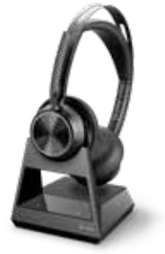
VOYAGER FOCUS 2 OFFICE