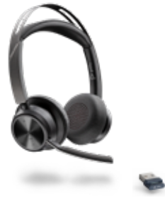
VOYAGER FOCUS 2 UC